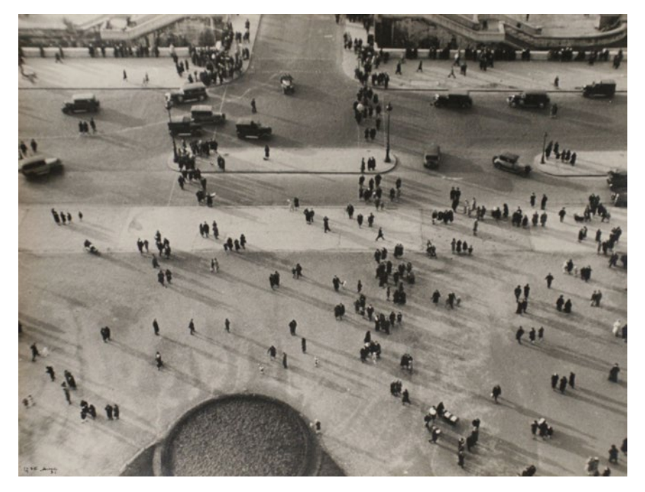
Ilse Bing: Champ de Mars, 1931, at Bruce Silverstein Gallery, New York City